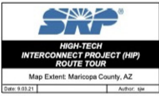
EXHIBIT A-3 Prefiling 9-8-21