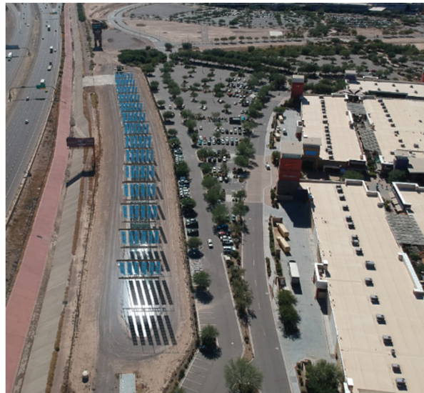
Gila River Indian Community