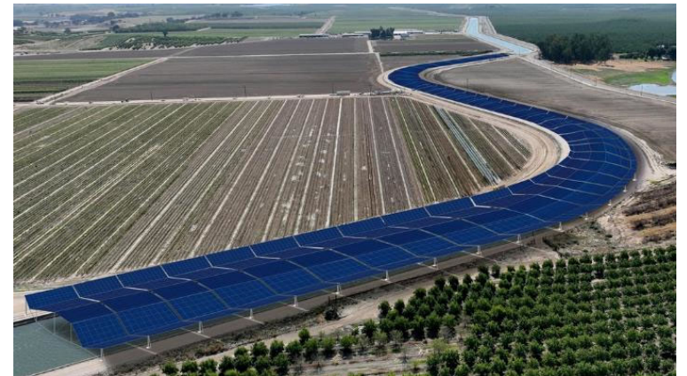
Turlock Irrigation District