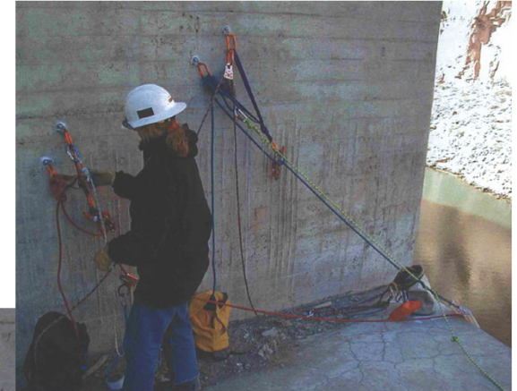
Visual inspection and sounding at Horse Mesa in 1999