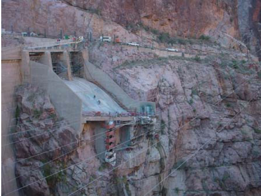
Horse Mesa Left and Right Spillways being repaired, with extensive scaffolding and equipment visible