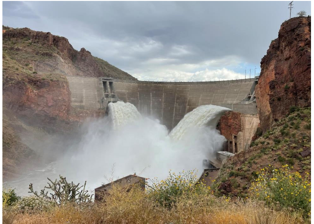
Spill test at Roosevelt Dam on May 10, 2023 Total flow at approximately 12,000 cfs

Thanks to Water Supply, Flight Services, Cyber Security, and the Bureau of Reclamation