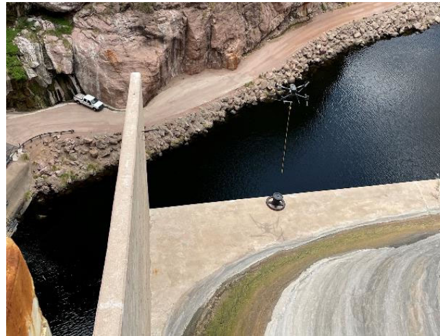
Sounding being performed on Horse Mesa Right Spillway in July 2022